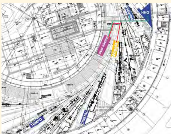
Figure 2: Diagram showing the location of the Femto-Slicing laser hutch, of the wiggler modulator, of the TEMPO and CRISTAL beamlines and of the HHG and PLEIADES experimental hutches.

constraints. The wiggler must emit radiation at the same wavelength as the laser (800 nm), the total radiated power must be below the limit set by the front-end of the beamline and the performance of the ring, in terms of emittance and beam lifetime, must be preserved. In addition, the wiggler must yield a high photon flux up to 50 keV to satisfy the PUMA beamline specifications. The magnetic studies, in one hand, and beam dynamics, on the other, have converged on to a wiggler with 20 magnetic periods of 164 mm, a length of 3.28 m and a maximum magnetic field of 1.63 T. The power emitted is 20 kW.